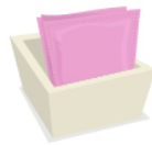
Saccharin 200-700 times sweeter