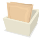
Sucralose 600 times sweeter