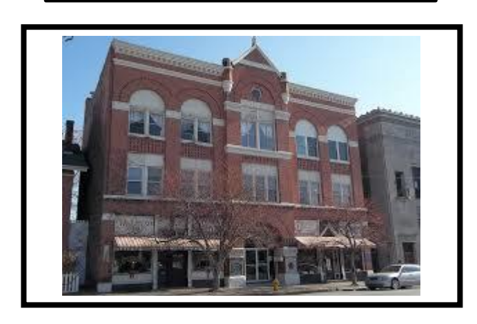
Hibernian Hall 421 Brady Street

Hibernian Hall was an Irish ethnic fraternal organization. The Irish started moving to Davenport after the Great Famine in Ireland of the 1840s and 1850s. In Davenport, the Irish were the second largest immigrant group, topped only by the Germans.