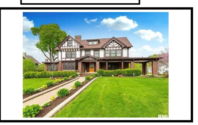
July 9, 2020