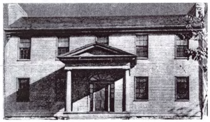
Colonel Davenport House

SCHPS Address 1820 Grant Street PM Box 5017 Bettendorf, IA 52722