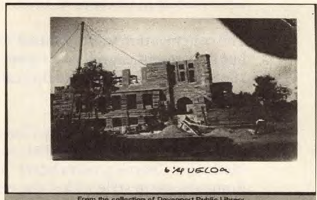
First Presbyterian Church under construction