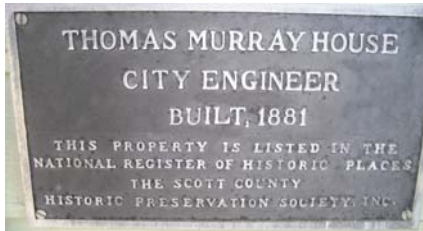
(Actual size 11.375" x 6.375")