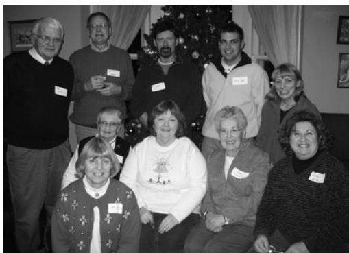
SCHPS Board at the Holiday Party