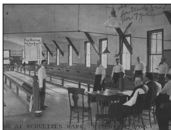
The famous bowling alley