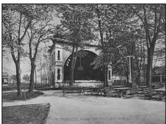
The music pavilion

To get to Schuetzen Park, take Waverly Road to the base of the hill, turn west (up the hill) to reach the Good Samaritan complex. Continue west, straight through the middle of the complex, until you reach the far west side. Park at the far south side of the parking lot, near the sidewalk, that leads downhill, toward the picnic pavilion. Bring a lawn chair and a 'potluck dish to share. We look forward to seeing you!