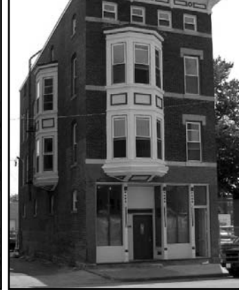
Right: Hammes Restoration