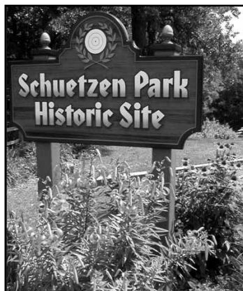
Bottom Right: Schuetzen Park Entrance