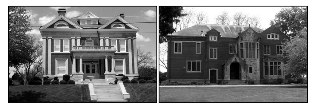
Left: The James C. Schricker House at 1446 Clay Street.

To get there, travel west on 4th Street and turn right on to Taylor. Go up the hill to Clay Street. Carpooling would be a good idea since parking on Clay Street is limited. See you there!