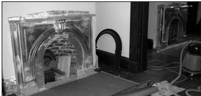
Come see the progress that's been made at the LeClaire House. Several Fireplaces will be done by the holiday party!

We'll celebrate the season and celebrate the continuing progress on the Antoine LeClaire House! Call Ella 441-0698 if you can help decorate on December 10 and take down decorations December 13.