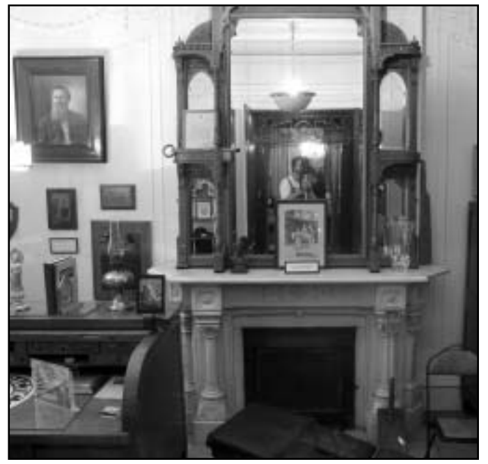
Photo of B.J. Palmer's Office inside the Mansion. Photo and copy courtesy of Palmer.

was discovered the kitchen had been painted once upon a in vibrant colors-red, blue, yellow and green. After the B.J.era paint job was discovered, a number of students and alumni came in and helped over a year's time to restore the kitchen walls. They have found the floor of many colors below what is currently there, that will be the next unveiling!