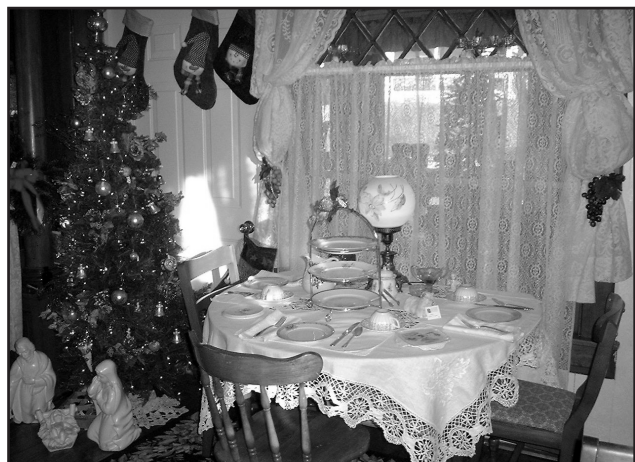
The Tea Room at Mrs. McGregor's Cottage is open Tues-Sat, 11am till 4pm.

Following dinner, the adventuresome at heart can continue the evening's merriment by climbing aboard the Village's antiques fire truck. A uniformed driver will tuck us beneath lap robes and wind his magic vehicle through the hills of McClellan Heights and Prospect Terrace for a breath taking tree top view of holiday light displays. We'll ride in style down the streets of downtown Davenport before making a stop at the animated Christmas windows at the