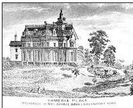
'Cambria Place'