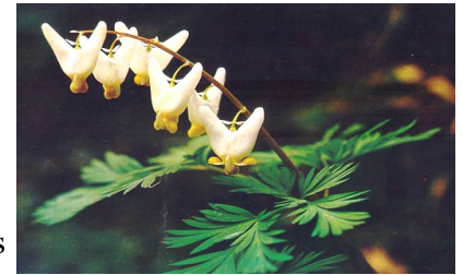
Flowers: Wapsi River Center

flowers are typically all white, but are sometimes found tinged with pink. They have yellow lobes at the base of the flower that open up like wings and reveal the stamens and style of the of the flower.