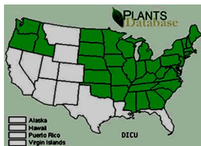
Dutchman's Breeches

The next time you are out taking a woodland hike in the springtime, look for those little white breeches hanging upside-down on their flower stalk. You may even get lucky and see a bumblebee gathering nectar from this plant! Dutchman's breeches are easily recognizable once you see it for the first time and hopefully you will remember it for years to come.